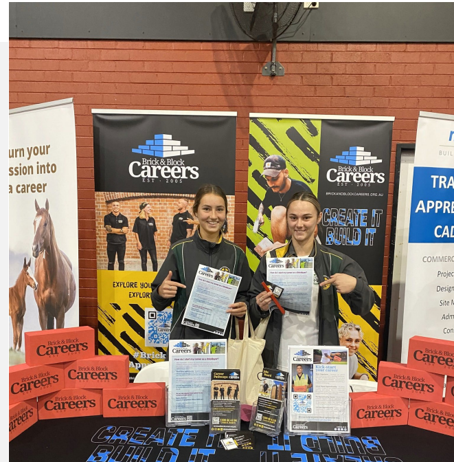
Hunter Valley Careers Expo