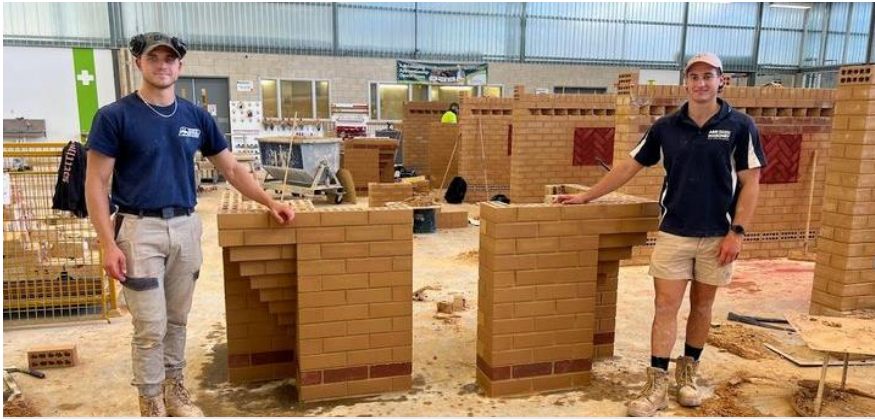
Apprentices displaying their work at TAFE SA