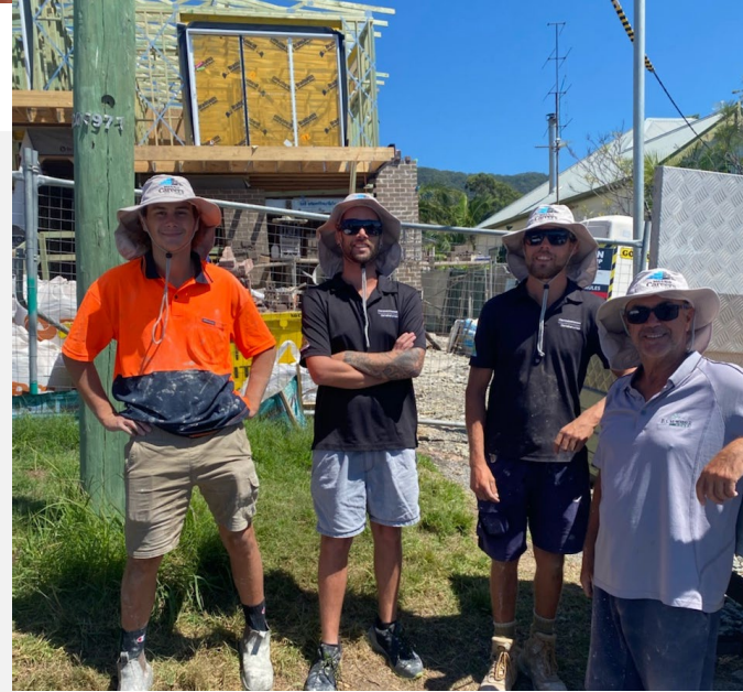
Our NSW Industry Engagement Officers met with LAY 'N' LEVEL Bricklaying in Wollongong to discuss the importance of hiring a new apprentice and potential collaboration opportunities.

Are you currently seeking skilled bricklayers to join your team?